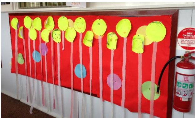
Student Work Displayed