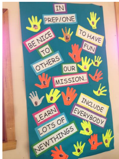
Positive Posters Events